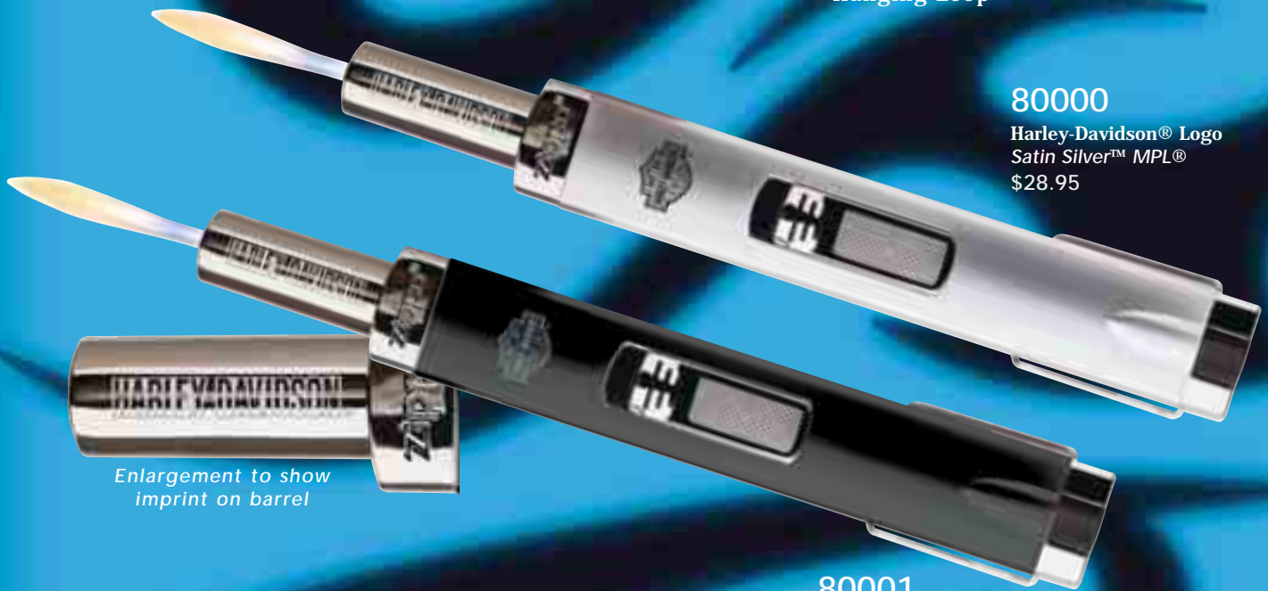
Enlargement to show imprint on barrel

80000 Harley-Davidson® Logo Satin Silver™ MPL® $28.95