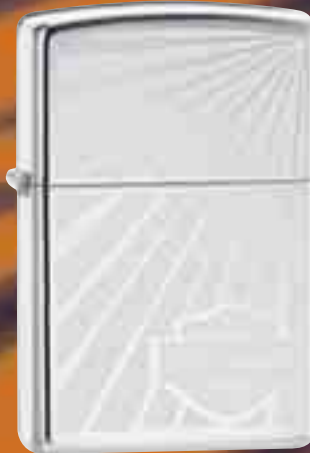
24292 Harley-Davidson® Burst High Polish Chrome $29.95