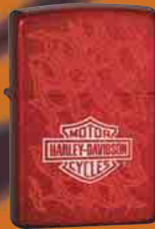
24022 H-D® Barbed Wire Facade Candy Apple Red™ $29.95