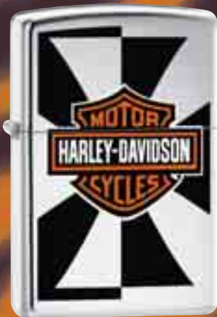
24024 H-D® Reflection High Polish Chrome $27.95