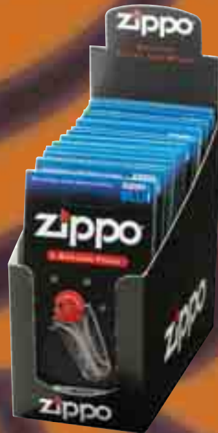
2406N Flint Cards - 24 cards per display box; 24 boxes per master carton $0.70/card