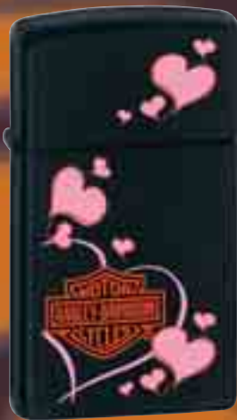
24395 H-D® Floating Hearts Slim Black Matte $31.95