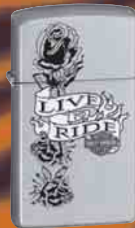
24008 H-D® Live To Ride Slim Satin Chrome™ $26.95

Sleek and sassy, these slim lighters have all the features of a full-size Zippo windproof lighter, in a trim, compact size.