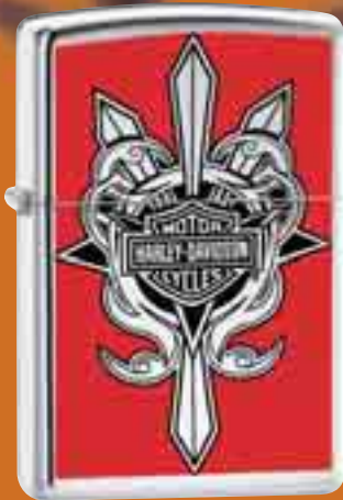
24393 H-D® Black High Polish Chrome $29.95