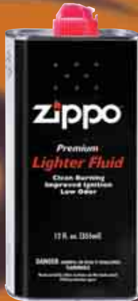
3165 Lighter Fluid 12 oz. (shipping carton of 24) $6.20/can (No. 3365 carton of 12)