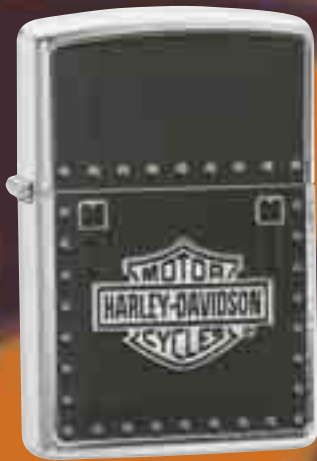
24168 H-D® Saddle Bag Emblem Brushed Chrome $45.95