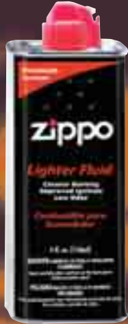
3141 Lighter Fluid 4 oz. (shipping carton of 24) $3.00/can (No. 3341 carton of 12)

For optimum performance of every Zippo windproof pocket lighter, we recommend genuine Zippo flints, wicks, and premium lighter fluid.