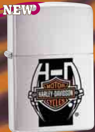
24505 Harley-Davidson® Brushed Chrome $27.95