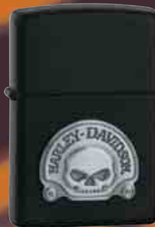
20582 H-D® Skull Emblem Black Matte $34.95