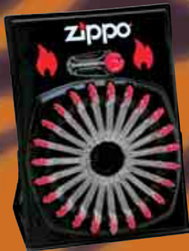
2406C Six Flint Dispenser - 24 per Display Card $0.70/dispenser