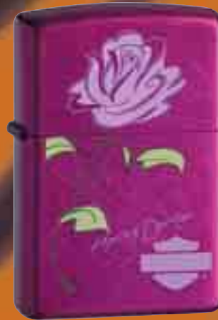
24166 Harley-Davidson® Rose Candy Raspberry™ $29.95