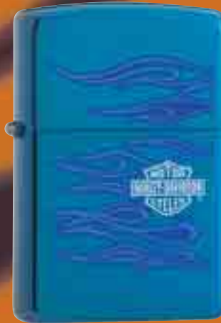
20711 Harley-Davidson® Ghost Sapphire™ $34.95