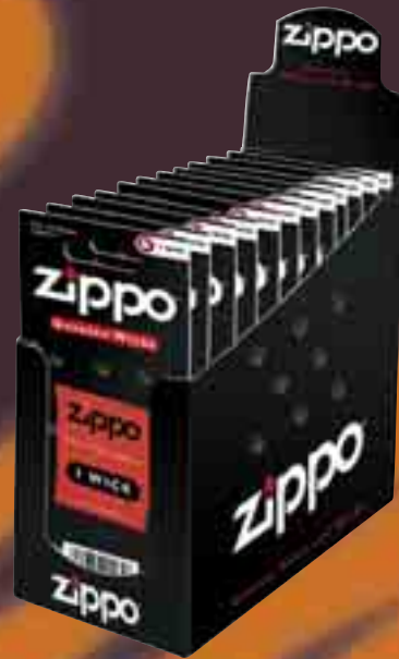
2425 Wick Cards - 24 cards per display box; 24 boxes per master carton $0.70/card